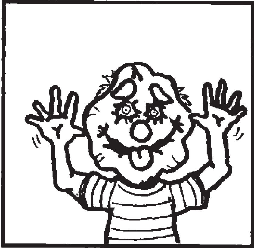
1) Make Masks